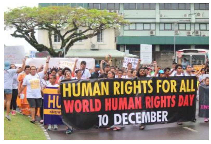
FWCC participating in a World Human Rights