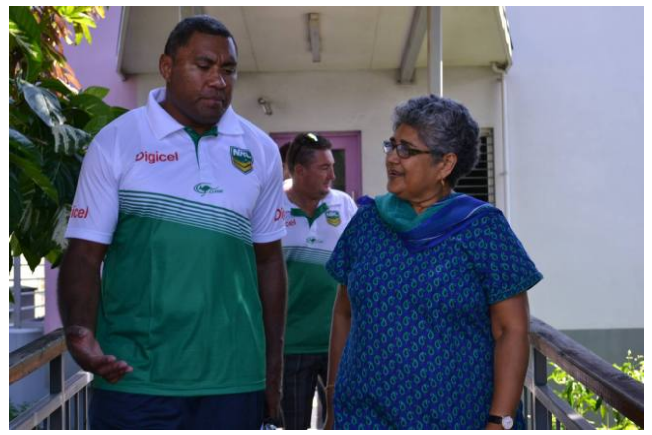
Former NRL star Petero Civoniceva with Shamima Ali at Fiji Women's Crisis Centre.