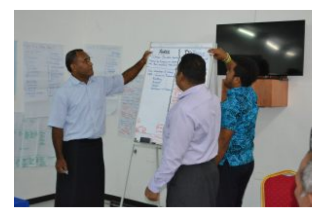
Twenty senior youth officers doing Gender, Violence against Women and Human Rights training, facilitated by FWCC staff.