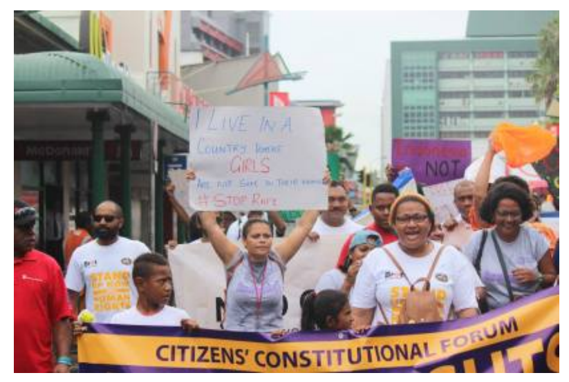
FWCC and other Fijian NGOs marching through Suva to mark World Human Rights Day.