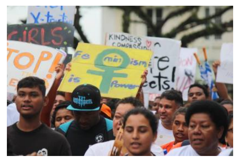
Pro-feminist marchers on the streets in Suva on World Human Rights Day.