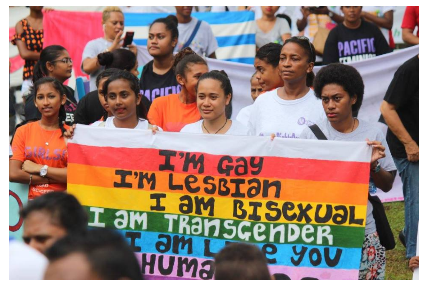
Activists marching through Suva to mark World Human Rights Day, and to call for gender equality.