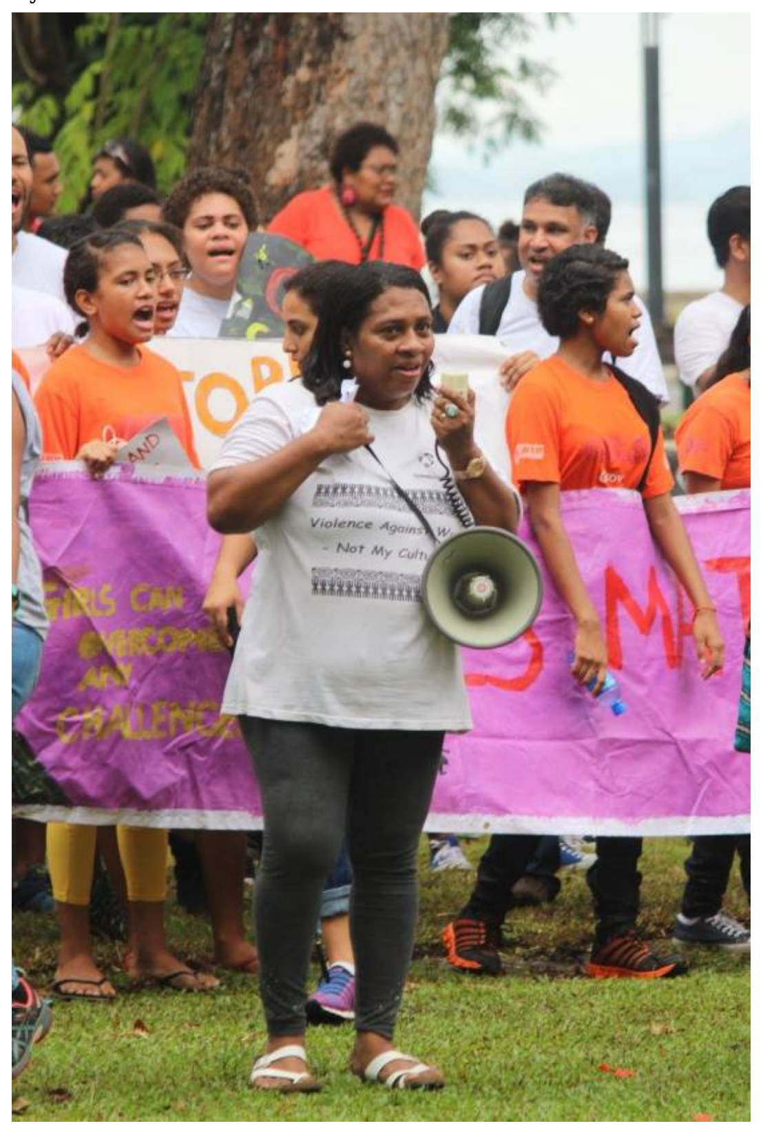
Women calling for an end to gender-based violence on World Human Rights Day.