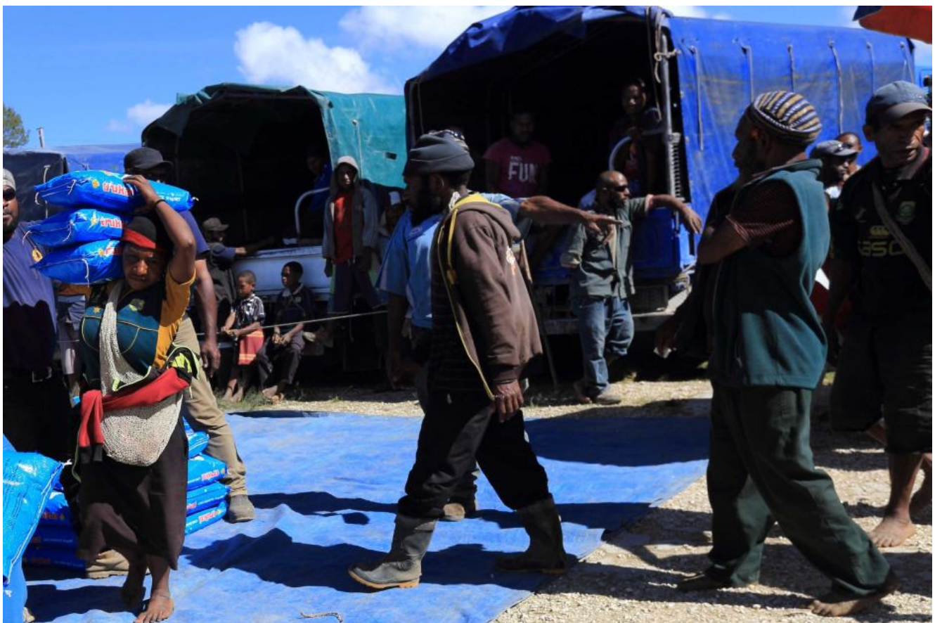
Rice distribution.