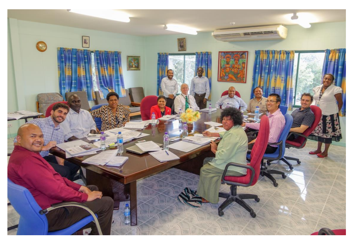
The PEPE advisory group meets at NRI in Port Moresby, September 2014.

The authors take full responsibility for the content of this report. It represents their views, and are not necessarily those of the institutions they represent or who have funded or supported this research, nor of any the individuals mentioned on the previous page.