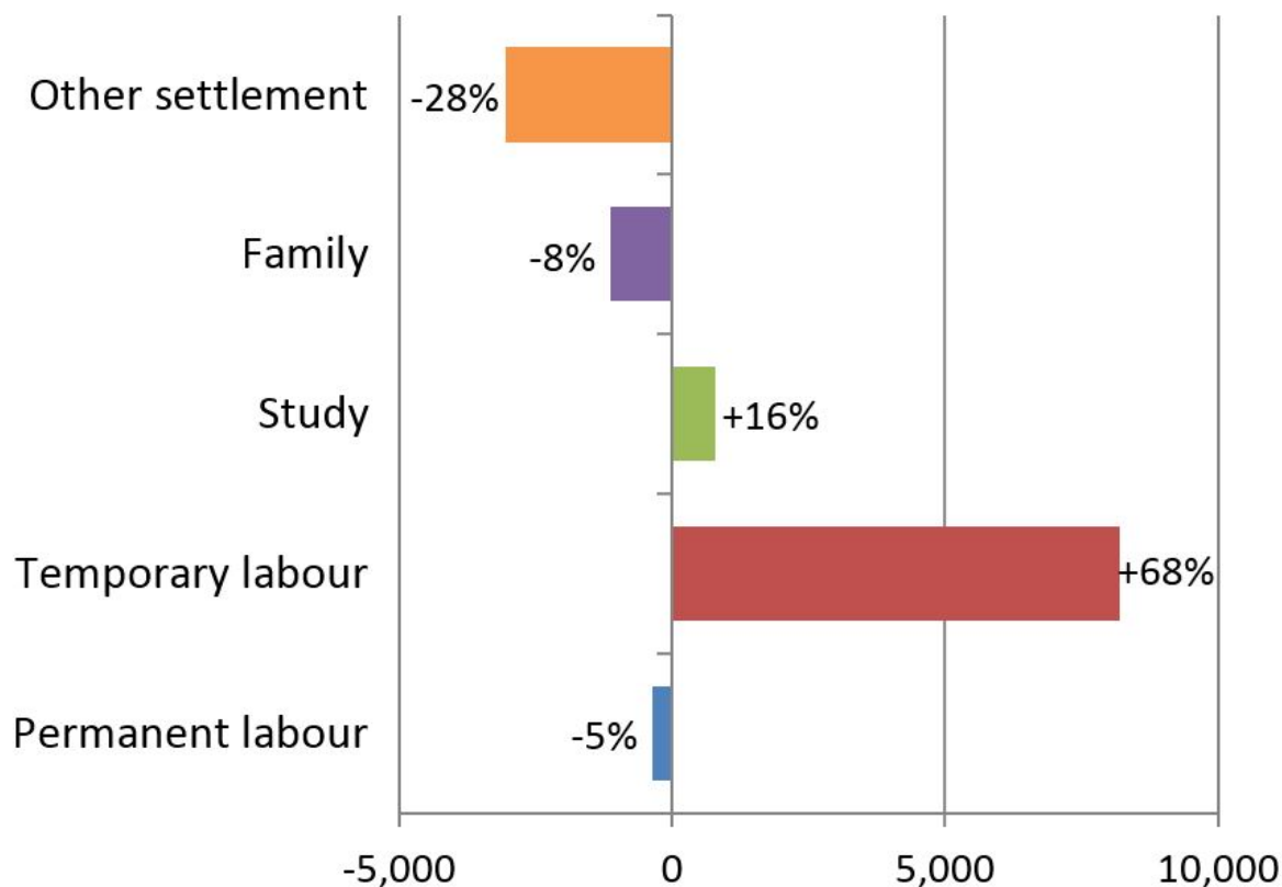
Figure 1: Admissions of Pacific migrants in New Zealand by category. Change between 2000-05 and 2010-15 (absolute values and %).