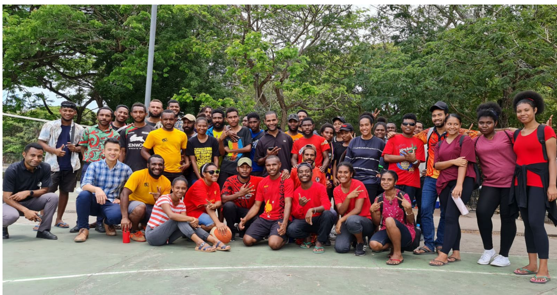
ESS Fun Day group photo