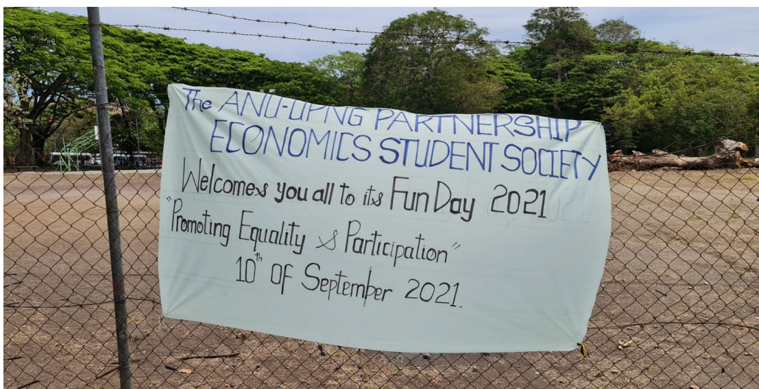
ESS Fun Day