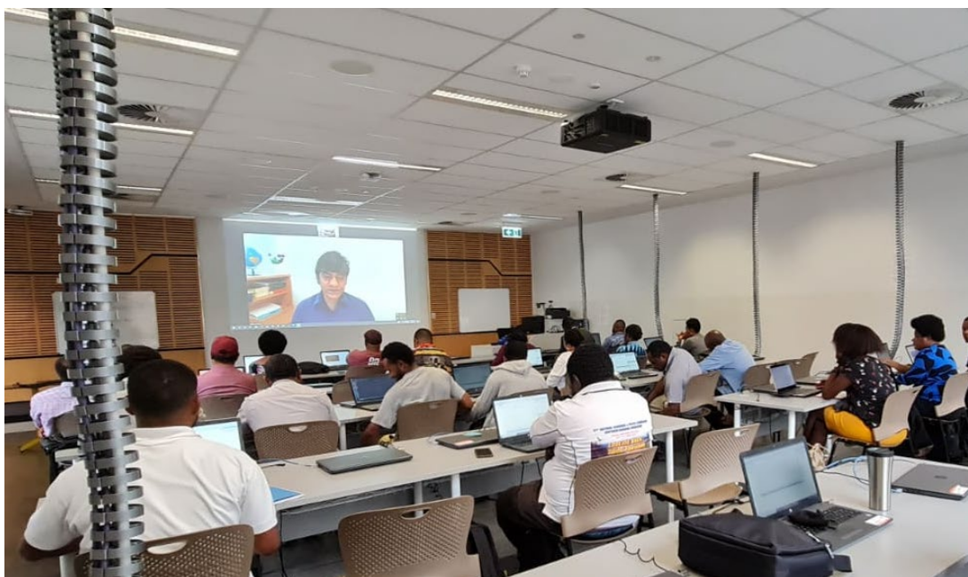
Stata training workshop in September