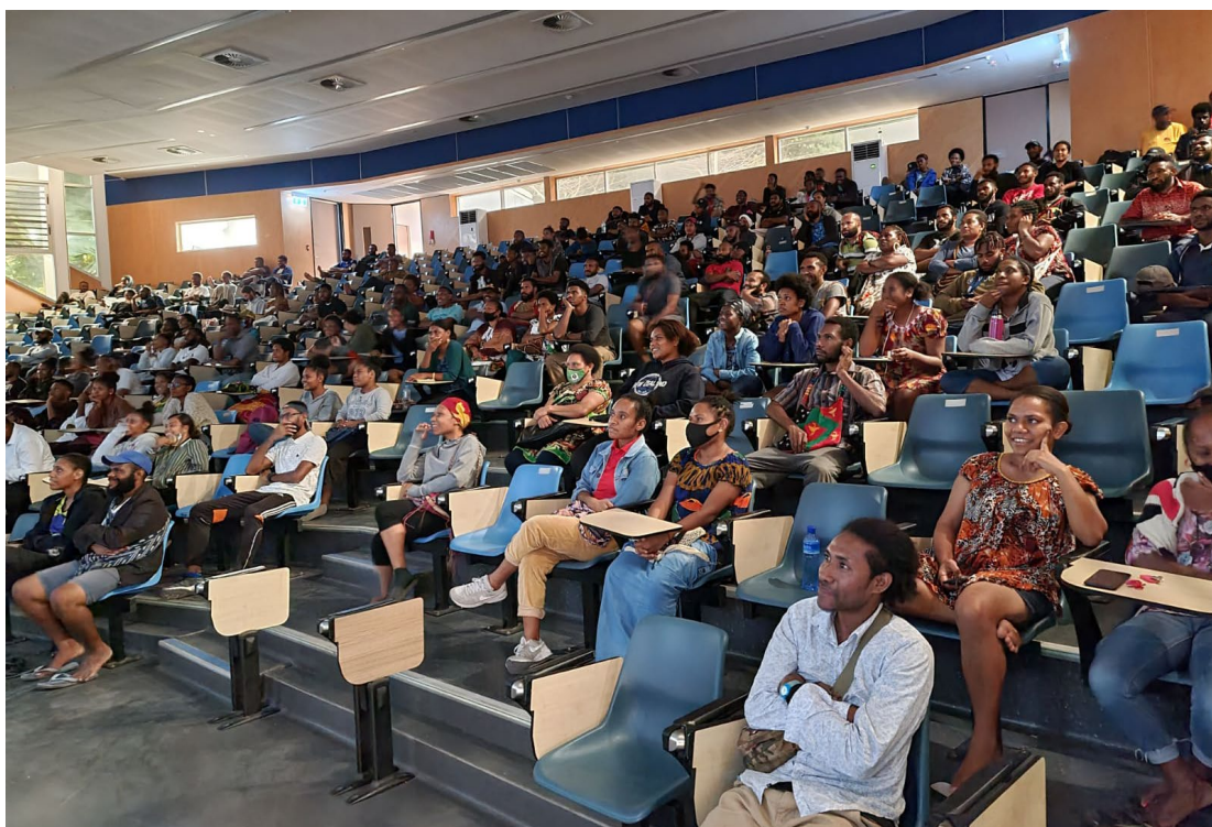
UPNG Inspired – September screening