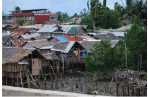
Village in Western Visayas, Philippines

Jason DeParle's A Good Provider is One Who Leaves is a timely work of genius. Over almost 400 pages it manages to be politically relevant but not partisan, emotionally compelling but never sentimental, and a conveyor of truths that are critical to understanding global migration but rarely get the attention they should.