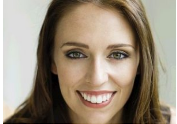
Jacinda Ardern

New Zealand has a new government — a coalition of Labour, New Zealand First, and the Greens. A new government means a chance to change aid policy. Change is needed.