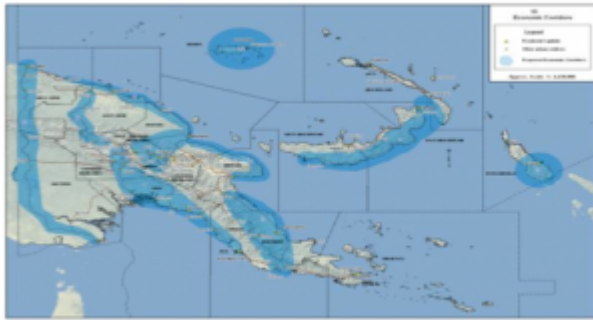
Chart 2: Proposed 10 Economic Corridors under PNG DSP

The economic Corridor Concept aims at converting corridors of poverty into economic corridors. The objective is to bring economic prosperity to remote areas of PNG where government and infrastructure services do not reach the people, but are areas that have strong economic potential. As such this concept