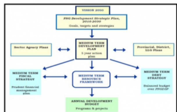
Chart 3: The planning and resourcing framework

The successful implementation of the PNGDSP depends on whether