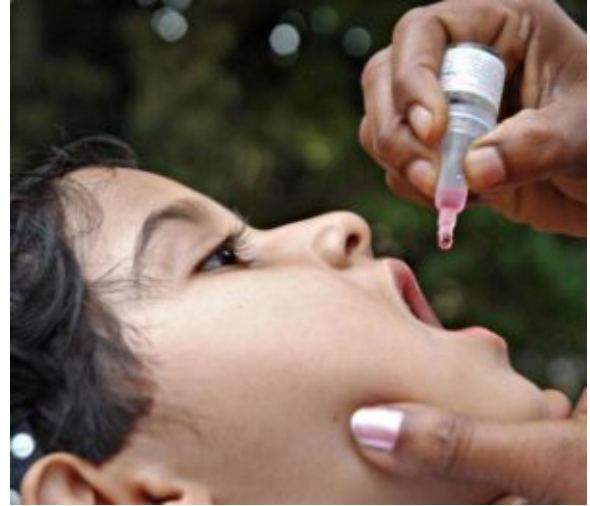
Pulse Polio drops being administered at Bal Bhavan in Bangalore.