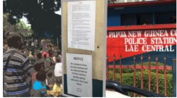
Women in the Biwat Settlement, a notice at the police station, and the Lae Central Police Station

This is the final blog presenting the findings of a research project exploring the impact of family and sexual violence (FSV) on families and children. Previous blogs have looked at services to address FSV in Lae, the impact on families , and the impact on school attendance . This post presents our findings on the relationship between the women in our study and the police, including the reasons they did or did not seek police help. This is important in light of the focus over the past decade on the police and criminal justice system in responding to family violence, as reflected in the enactment of the Family Protection Act 2013 and the rollout of specialist Family Sexual Violence Units (FSVU) in many police stations.