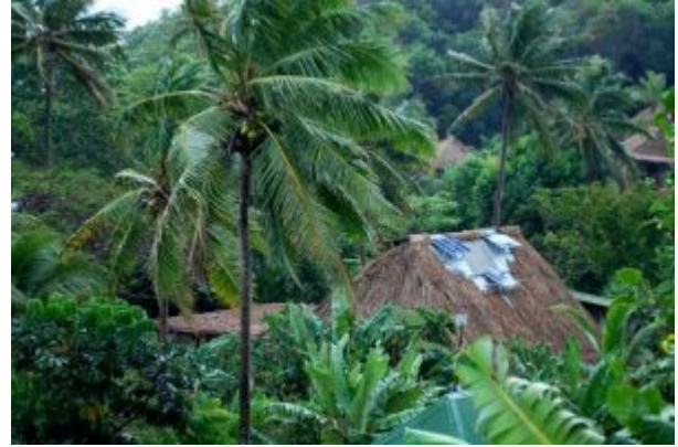
Solar Power at Matava Fiji's Premier Eco Resort

In under a week, the 23rd Conference of the Parties ( COP23 ) of the UN Framework Convention on Climate Change will be held in Bonn, co-hosted by Germany and Fiji. The president of the conference is Fiji's Prime Minister, Voreqe Bainimarama, who has urged the global community to establish more ambitious targets to curb greenhouse gas emissions.