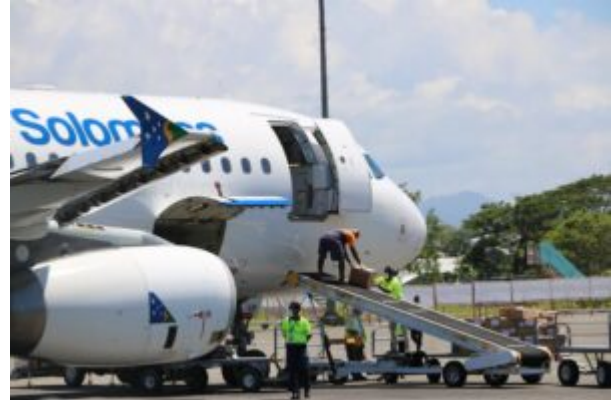
Baggage handlers unload Australian funded COVID-19 response supplies to the Solomon Islands