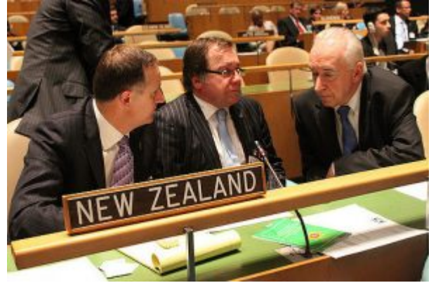
John Key, Murray McCully and Jim McClay at the UN

On Monday (1 May), Murray McCully will step down as New Zealand's foreign minister, to be replaced by Gerry Brownlee. Brownlee is a long serving politician, but it will be his first stint in foreign affairs and he has no aid experience.