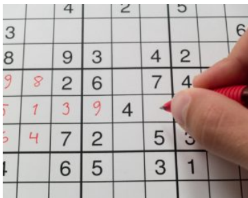
Sector spending sudoku

First, while the country tables are clear, the sectoral allocations require some inference (Chapter 4). The sectoral spending has been tweaked and is aggregated in a slightly different way than previous budgets—health now includes water and sanitation, and governance has been split into two categories—so seasoned aid watchers will need to be mindful of this.