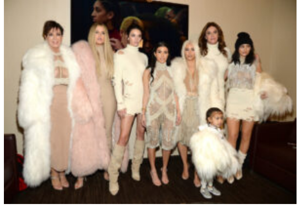
The Kardashian family

Recently I was asked to participate in the “Great Debate”, an academics versus students comedy debate that is part of ANU Asia Pacific Week, on the topic of “Does foreign aid do more harm than good”. Myself and the other academics were on the negative team, and managed to keep the crowd on side (who were already supportive of aid at the beginning).