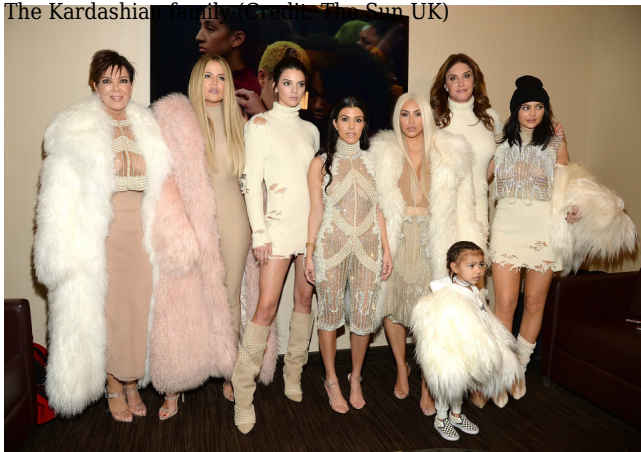
The Kardashians Family