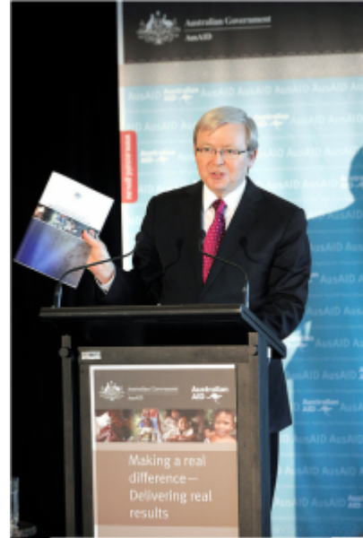
Minister for Foreign Affairs (and International Development?)