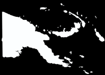
Papua New Guinea