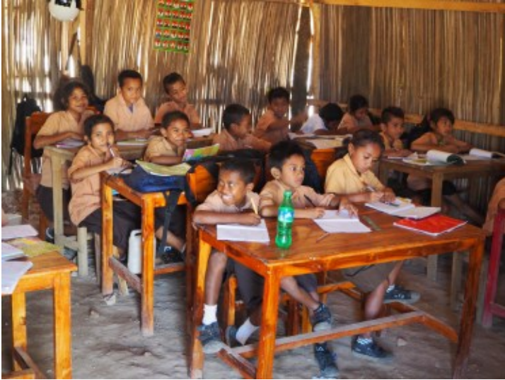
A West Timor school provided with furniture by NTA.