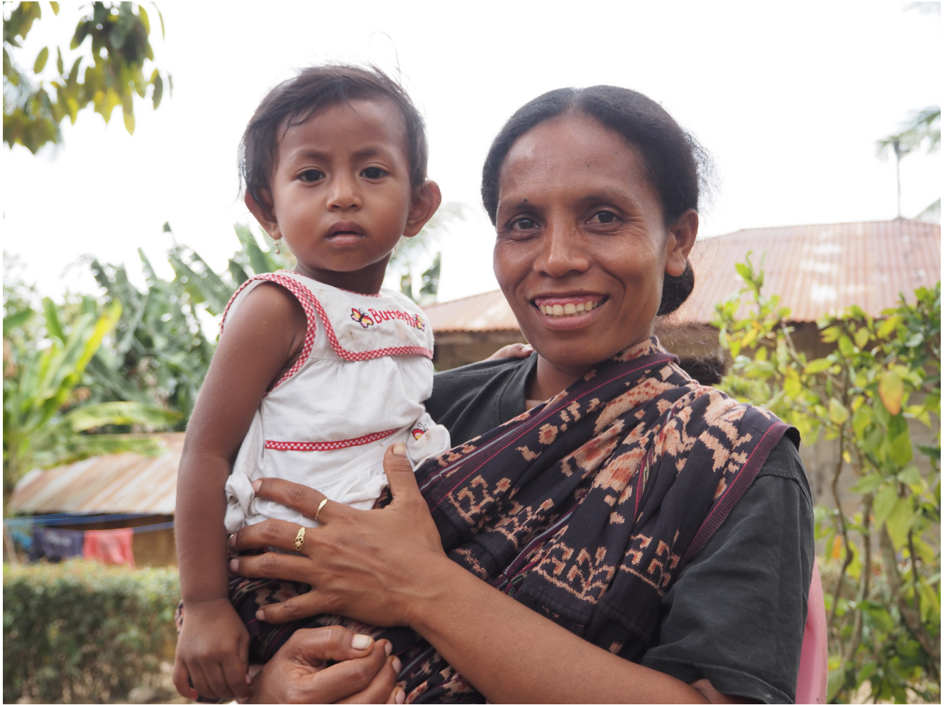
Beneficiaries in Flores.