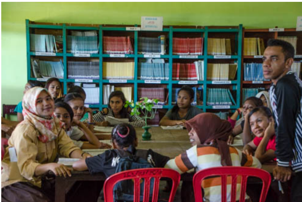
NTA helps poor rural schools by providing training for unqualified teachers, library training and books, toilets and water tanks.