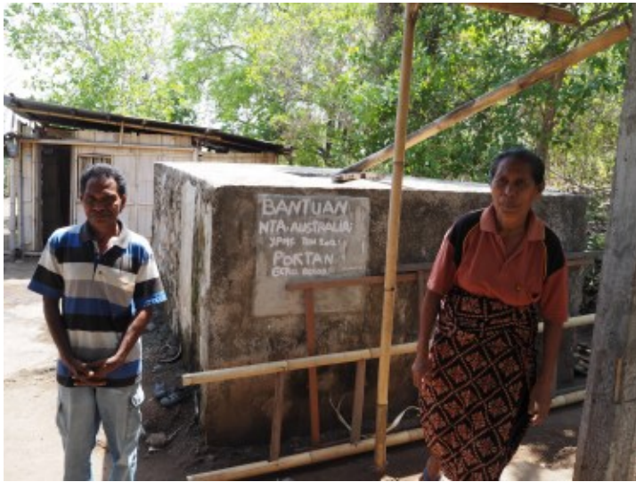
A concrete water tank constructed in Flores.