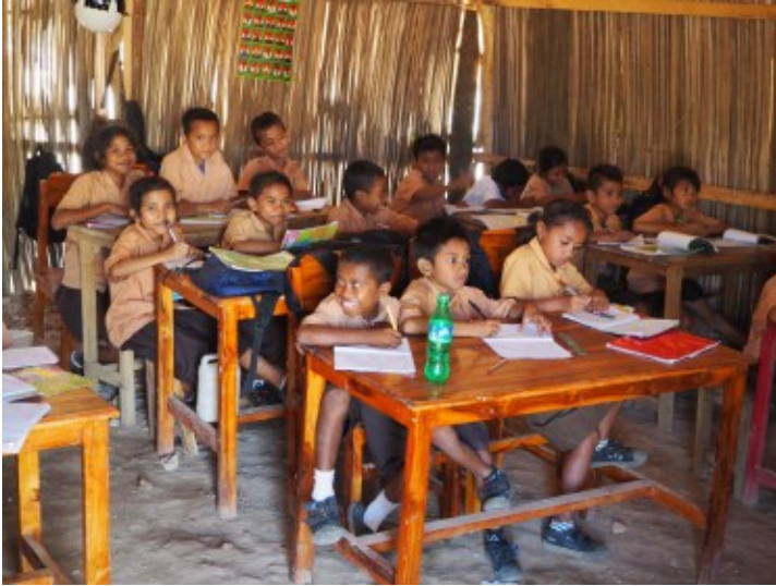
A West Timor school provided with furniture by NTA.