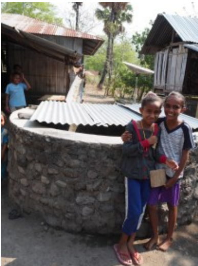
Girls stand next to an off-roof water tank constructed as part of an NTA program.