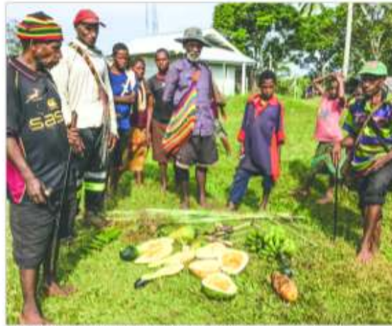
Villagers from around the area bring food to show the damage caused by drought, insects, pests and rats.