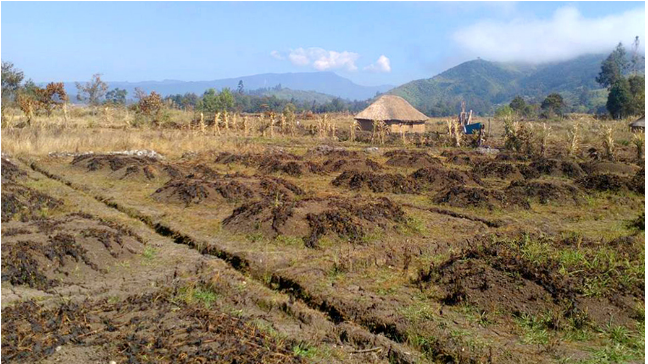
Frost-burnt food in PNG.

Mougulu, a mission station in the Strickland Bosavi region of Western Province was one of these places. Built within the territory of the Bedamuni tribe, of which there are some 12,000 members, the settlement at Mougulu has been carved out of a harsh and rugged environment. After months without rain, the crops that the people here rely on as their only food source had failed. When rain began to return in fits and starts, insect and rat infestations ruined much of what grew. At the usually busy market, the stalls were as good as bare: a pumpkin, a bunch of greens, a handful of beans to share among a couple of thousand people.