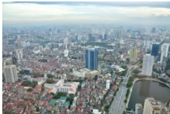
Hanoi skyline

Vietnam has recently gained international accolades for its successful campaign against COVID-19 with only 332 confirmed cases and no deaths (as of 12 June), thanks to a swift action plan and a decisive three-week social distancing period from 1 to 22 April. The lockdown undoubtedly stalled the economy, as major activities, including industrial manufacturing and transportation, are reduced at significant levels. Despite this economic setback, the capital Hanoi has seen cleaner and clearer skies during the lockdown period, similar to other major Southeast Asian cities . The clean air was a positive side effect for Hanoians, whose city was ranked the seventh most polluted city in the world in 2019. The ambient air pollution potentially costs Vietnam more than 52,000 deaths every year, creating an annual loss of up to US$13.2 billion, about 5% of national GDP.