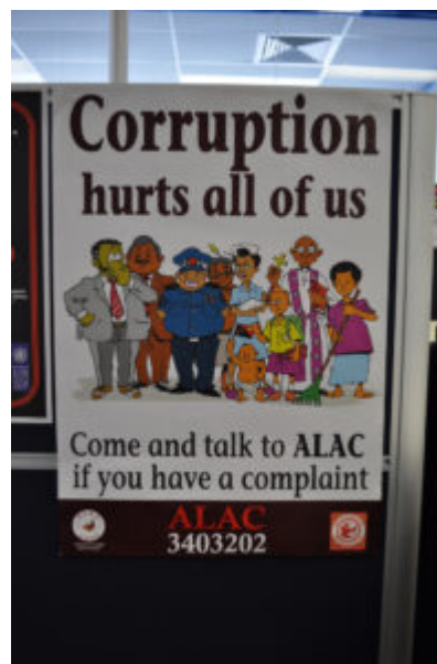
PNG anti-corruption poster

Last year we compared ten years of budgetary allocations and spending on PNG's anti-corruption agencies. We found significant and growing gaps between what the PNG government promised to anti-corruption agencies and what they actually received. In this blog we draw upon updated analysis , including the recently released 2018 budget figures, to show how the state's anti-corruption agencies have fared under Treasurer Charles Abel's first budget.