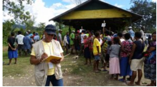
Voters queue to vote in PNG's 2017 elections

Are women becoming more competitive in national elections in Papua New Guinea? The obvious answer would seem to be no. In 2012 three women were elected; in 2017 none were. But looking at winners alone hides as much as it reveals. Even if women aren't winning elections, the average woman might still be becoming more competitive.