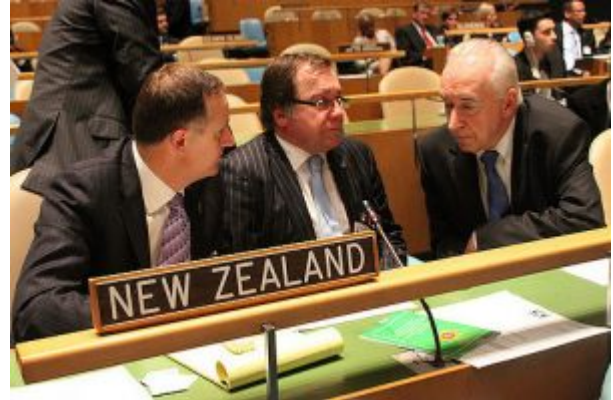
John Key, Murray McCully and Jim McClay at the UN

When is a 12 per cent increase not, actually, a 12 per cent increase? When it is to the New Zealand aid budget, sadly. In Australia there would be scenes of jubilation within the aid community if the aid budget went up by 12 percent. In New Zealand things aren't that simple. This chart shows why.