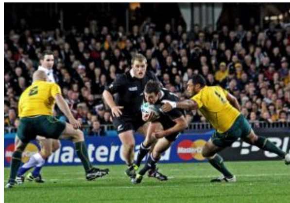
Australia v New Zealand

If you're going to ignore international norms, it's always easier if someone else is ignoring them with you. Once, New Zealand helpfully provided Australia cover when it came to being a miserly aid donor. This is no longer the case. As Australia's inflation-adjusted aid spend continues to slide , something odd has happened over the Tasman.