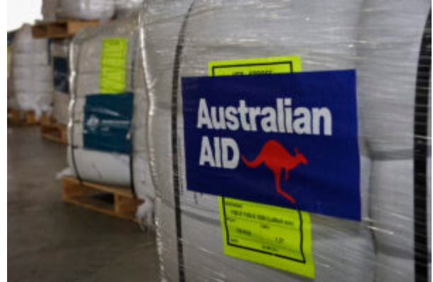
Pallets for AusAid emergency aid supplies are prepared for delivery to cyclone ravaged Fiji

The recently-released 2018 Commitment to Development Index ranks some of the world's richest countries by their dedication to policies that benefit people living in poorer nations. The index ranks countries across a range of areas. One of them is the quality of the aid a country gives. Each country's aid quality score is based on the quality of a country's bilateral aid as well as the quality of the multilateral organisations that it gives aid to. These aid quality scores come from the Quality of ODA dataset (QuODA) that the Center for Global Development also maintains.