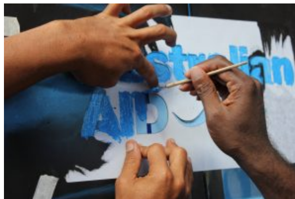
Painting the Australian Aid logo, Solomon Islands

Last month, the Center for Global Development (CGD) in Washington released its 2017 Commitment to Development Index (CDI). This annual ranking assesses 27 of the wealthiest countries on the impact of their aid, finance, technology, environment, trade, security, and migration policies on developing countries.