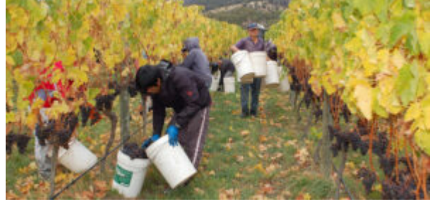
Wine grape harvest at Granton Vineyard, Tasmania