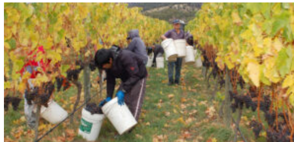
Wine grape harvest at Granton Vineyard, Tasmania

In New Zealand, for every 1,000 backpackers picking fruit and vegetables there are about 2,600 seasonal workers, mainly from the Pacific. In Australia, the mix is completely different. For every 1,000 backpackers there are only about 130 Pacific seasonal workers.