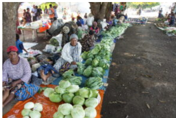
Local market in Intoap, Markham valley, Papua New Guinea