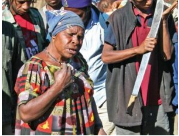
Front cover of 'Large-Scale Mines and Local-Level Politics'