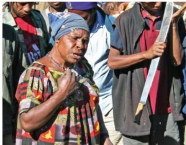
Front cover of 'Large-Scale Mines and Local-Level Politics'