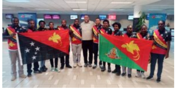
Governor Allan Bird (centre) with people from East Sepik leaving to work in Australia