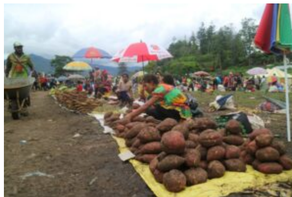
Goroka Main Market (temporary location), Goroka, 2019

As places to buy, sell and socialise, marketplaces are a part of daily life for many Papua New Guineans. Marketplaces are critical to food security: they provide a source of income to rural people that is more stable than the volatile and periodic income earned from export tree crops (coffee, cocoa and oil palm), and they are by far the most significant place where fresh food is sold. The sale of fresh food and betel nut in marketplaces also provides money to more Papua New Guineans than any other source . Marketplaces are particularly important for the incomes of women [paywall], who are the dominant vendors and who are frequently poorly remunerated for their labour in export crop production. An increasing number of urban residents are also making a living in marketplaces. In some ways marketplaces have changed very little since they were introduced during the colonial period, however in other ways marketplaces are changing rapidly.