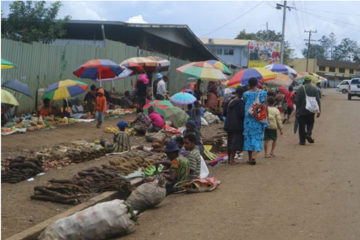
Seigu Market, Goroka, 2019