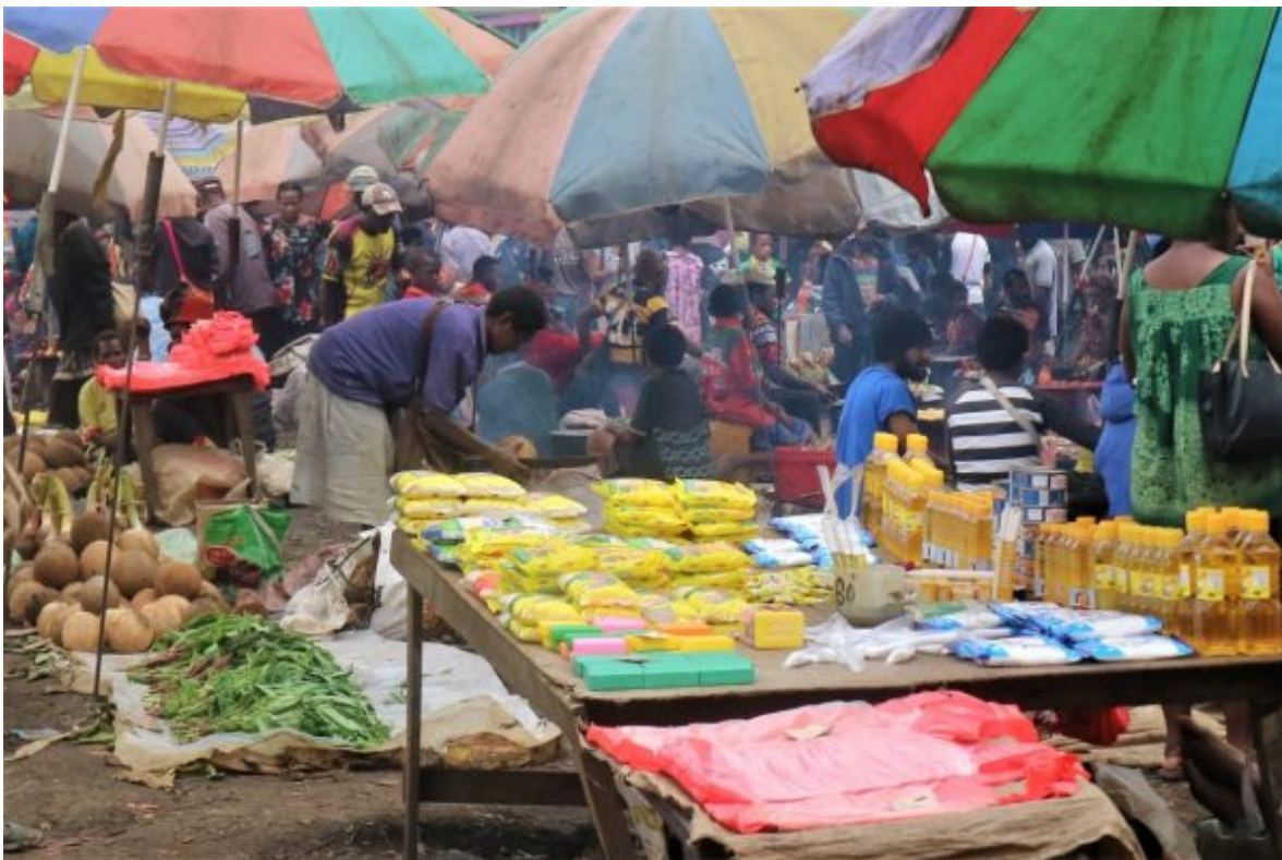
Goroka Main Market (temporary location), Goroka, 2019

Most of what is sold in PNG's marketplaces is domestically produced fresh food. However, in the past decade there has been an increase in the sale of 'store goods'. This includes items such as rice, salt, oil, candles, cigarette lighters, soap, lollies, soft drinks, cigarettes, plastic bags, second-hand clothes, and mobile phone credit. In some marketplaces items such as thongs, pirated DVDs, medicines, and torches are also sold. Cooked food produced from store goods such as sausages, lamb flaps and flour balls, is also common.