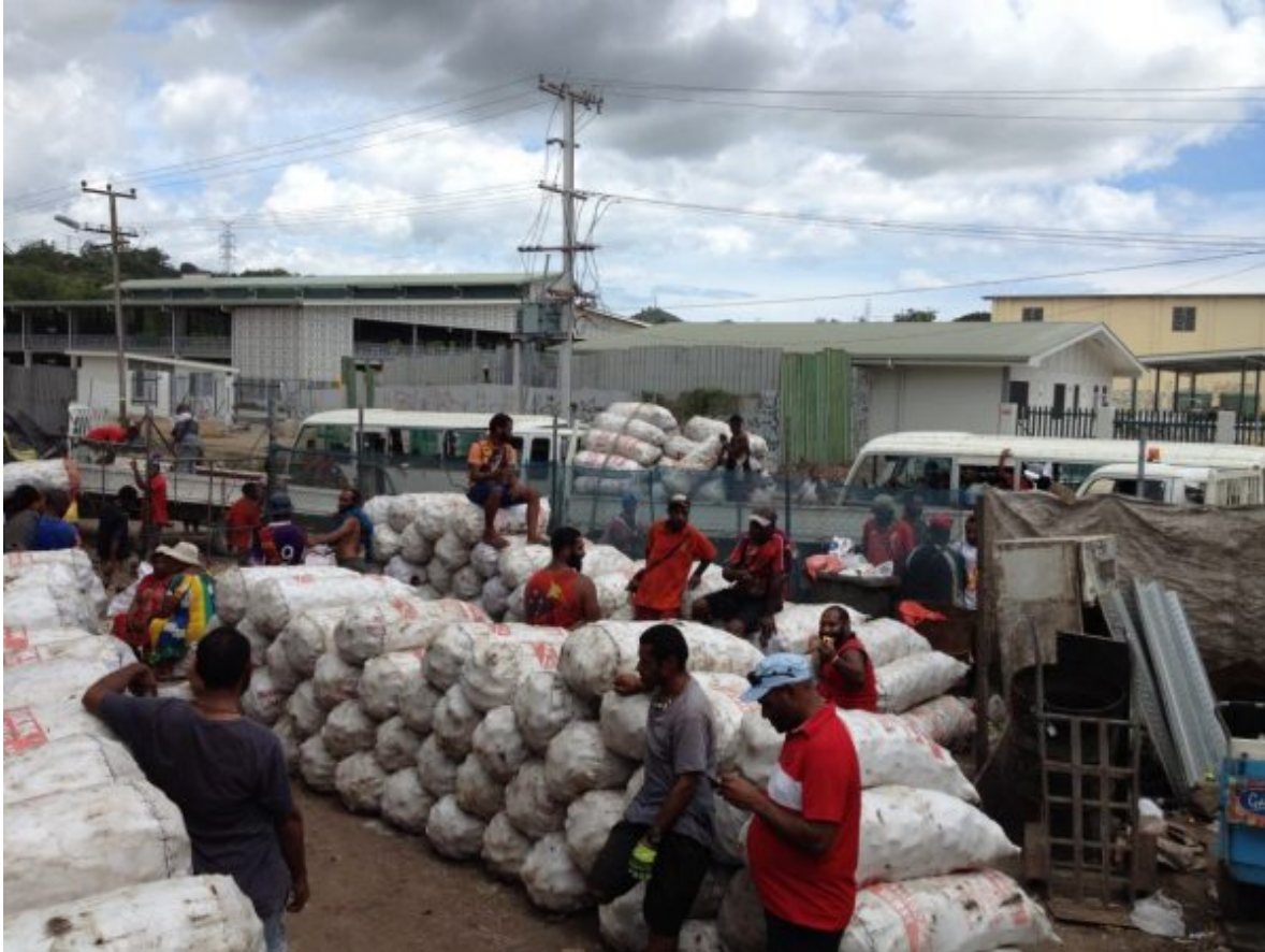
Wholesale yard near Gordons Market, Port Moresby, 2019