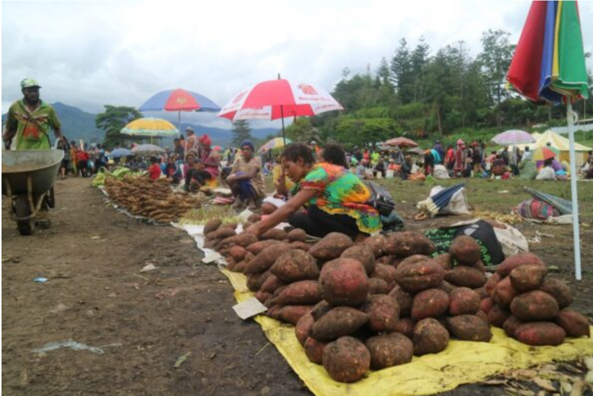
Goroka Main Market (temporary location), Goroka, 2019

friends and relatives, to share news and gossip, and pass the day.