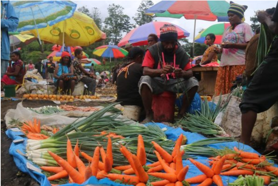
Goroka Main Market (temporary location), Goroka, 2019