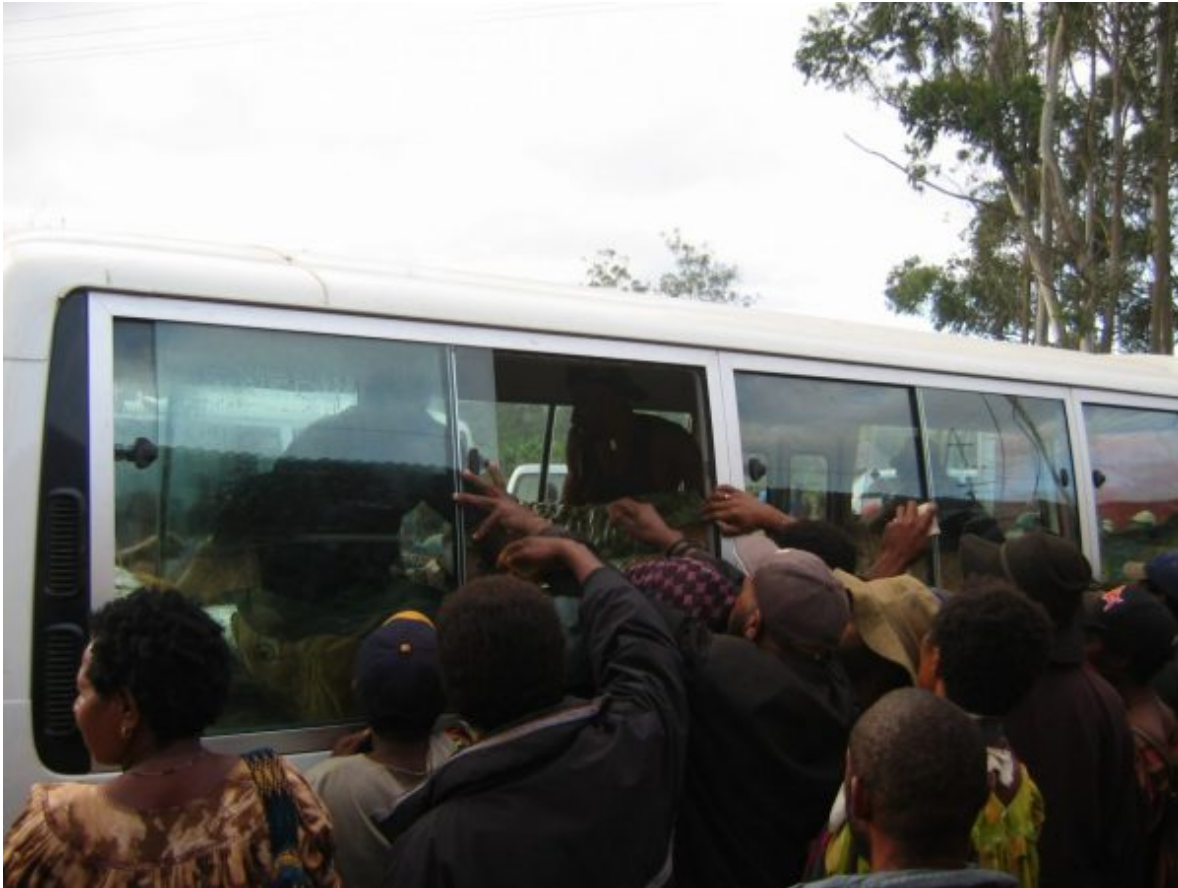
Kaiwei Market, Mt. Hagen, 2007