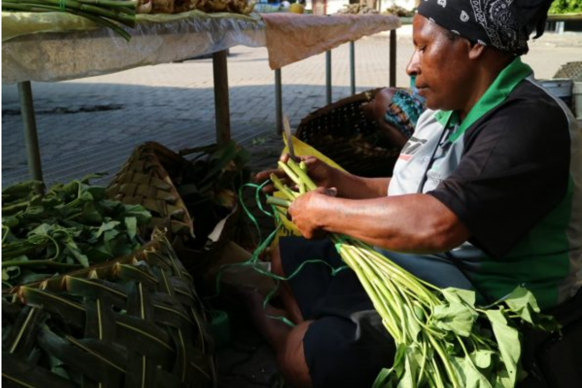
Re-bundling greens at Kokopo Market, 2017