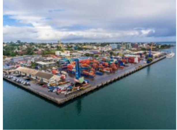
The port of Suva

World leaders are gathering in Port Moresby this week for the APEC Leaders' meeting. On the sidelines, Xi Jinping will be meeting with leaders of Pacific island countries that recognise the one China policy. The meeting will be watched closely in Australia. Xi Jinping is widely expected to make announcements relating to enhanced cooperation with the region, and Chinese lending is sure to be a focus of resulting commentary in Australia. However, it is the changing nature of trade ties with the region that present a more significant challenge to Australian policymakers (even if the two are somewhat related).