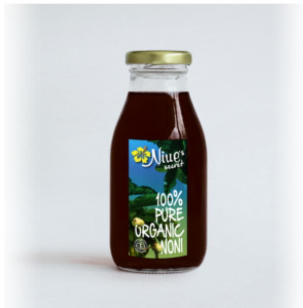
Noni juice, an export of Niue

The recent China International Import Expo (held in Shanghai from 5–10 November) represented a valuable opportunity for Pacific island countries (PICs) to promote their products to Chinese importers and consumers. The eight PICs that have diplomatic relations with China — Papua New Guinea (PNG), Fiji, Vanuatu, Samoa, Tonga, Federated States of Micronesia (FSM), Cook Islands and Niue — displayed their featured products (Table 1). Although the expo was designed to showcase China's commitment to promoting free trade and reducing its trade surplus with partner countries, the sheer scale of China's economy means that an imbalance in bilateral trade between China and PICs is ingrained.