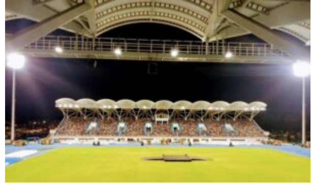
The Chinese-funded stadium at the opening of the Pacific Games