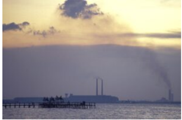
Indonesia has made commitments to reduce emissions by 29% by 2030