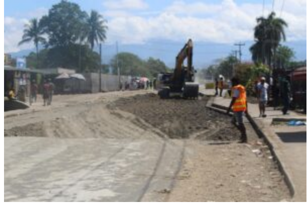
Roadworks on the Malahang-China Town Road in Lae, August 2022