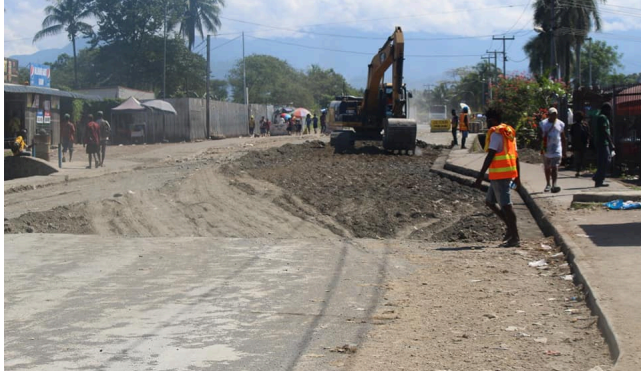
Roadworks on the Malahang-China Town Road in Lae, August 2022