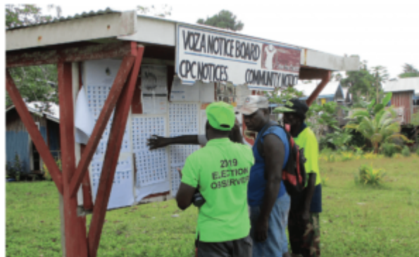
A 2019 Solomon Islands election observer in the community