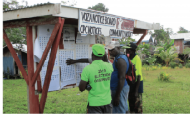
A 2019 Solomon Islands election observer in the community