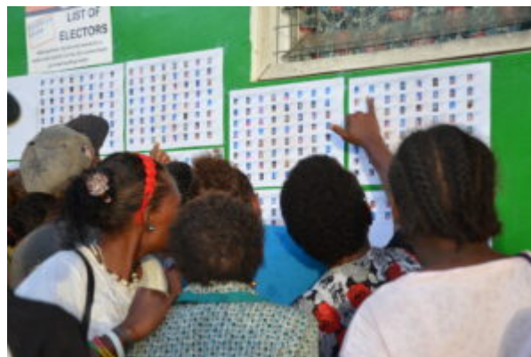
Solomon Island voters examining the list of candidates in the 2019 election