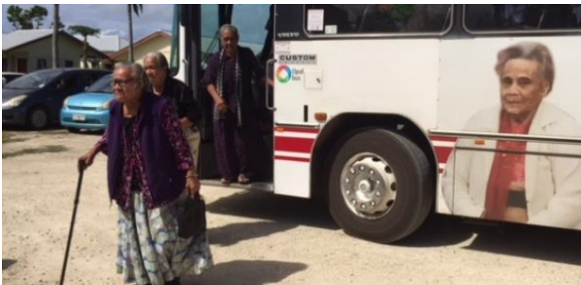
Elderly Tongans arriving at the National Retirement Benefits Fund office in Nuku’alofa to collect their top-up cash transfers

TC Gita ultimately passed directly to the south of Nuku’alofa and severely impacted large parts of the main island, Tongatapu, and neighbouring ‘Eua. The following morning, before the cyclone had fully cleared, Tongans were out on the road clearing the debris from the night before. The response from the people and Government of Tonga was swift. The UN Humanitarian Cluster system was quick to activate and the major donors provided rapid assistance. However, one element of the response was particularly noteworthy: the Government channelled nearly a million Tongan Pa’anga ($A500K) through their Social Welfare Scheme for the Elderly and Disability Benefits Scheme – the Government’s two core social protection programs. These are two vulnerable groups that weren’t in a position to rebuild the following morning. The cash was quick to be disbursed, given the programs are already operational, and provided funds for their immediate post-disaster needs. The financing was provided by the Australian Government, but drawing on the Government’s SP systems.