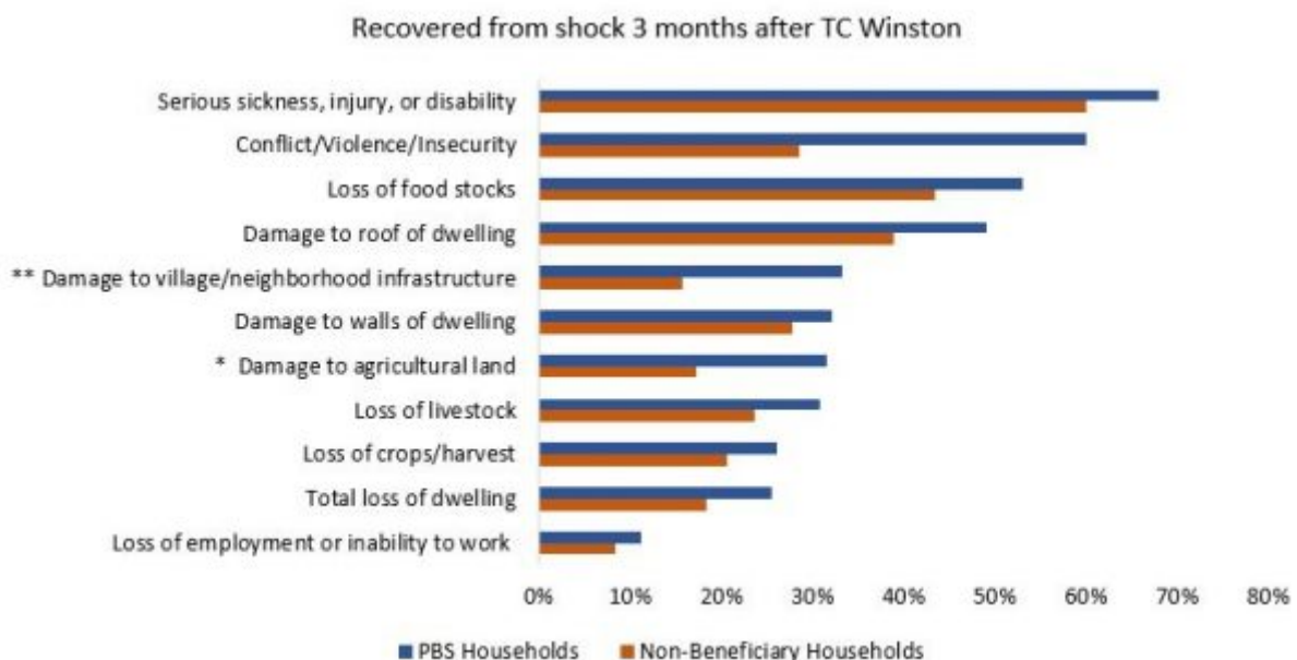
Figure 2: beneficiaries of shock-responsive social protection are quicker to recover