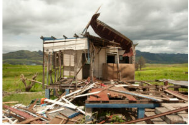
Some of the destruction wrought by Tropical Cyclone Winston along Kings Road on Viti Levu, Fiji