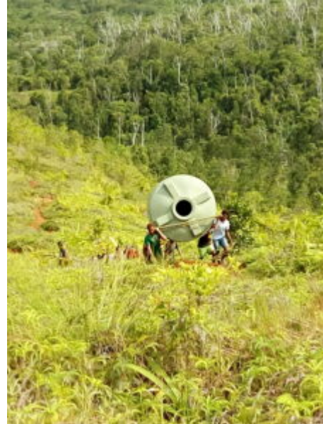
A water tank on its way up to the village

I was far enough into the mountains for the air to be fresh. The village was tidy, the paths between the houses carpeted with grass. Views spilled away in every direction: sea, islands, the spine of the land.