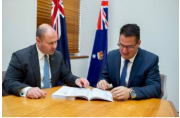
The Treasurer and Minister for International Development looking over the 2021 budget papers