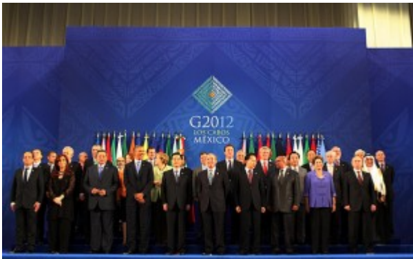
G20 on development

The 2012 G20 leaders' summit, this year in Los Cabos, Mexico, was once again dominated by the Eurozone crisis. Development issues feature strongly towards the end of the 85-para communiqué under the three priorities of the Mexican Presidency – food security, infrastructure, and green growth – but, with a few exceptions, appear to contain little new. Earlier G20 assurances that aid commitments would be honoured are missing. The innovative financing agenda for development (taxes on financial transactions etc.), heavily promoted by France as G20 President in 2011, appears to have been dropped.