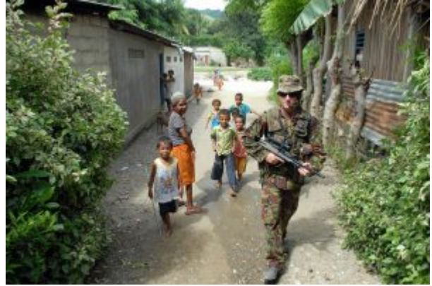
New Zealand Defence Force in Dili, Timor Leste 2007

Last year Camilla Burkot and I reported on our preliminary analysis of a public opinion survey we had conducted to better understand New Zealander's views about aid. You can read the full blog post here , but in a nutshell New Zealanders were less enthusiastic aid-cutters than Australians, and — like Australians — most New Zealanders wanted their aid spent on helping people in need, rather than aiding their own country.