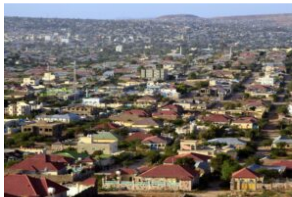
Hargeisa, the capital of Somaliland