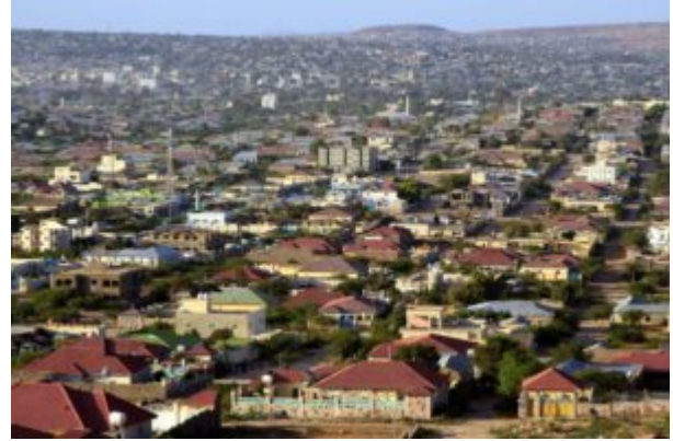
Hargeisa, the capital of Somaliland