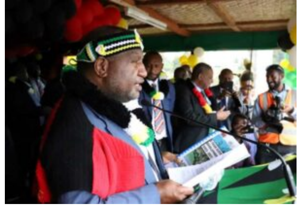
PM James Marape in Enga Province, January 2023