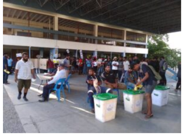
Students vote in the 2021 UPNG elections