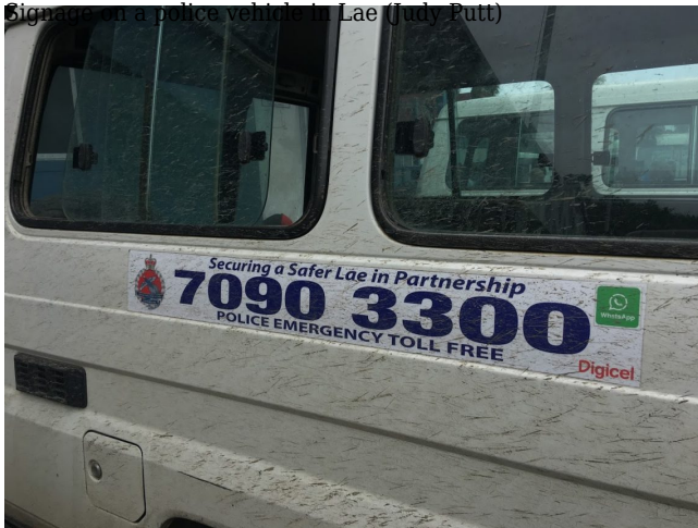
Signage on a police vehicle in Lae (Judy Putt)